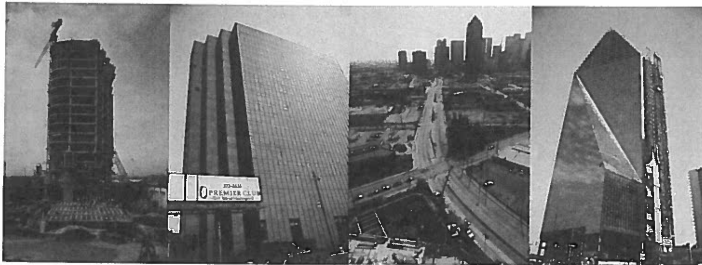
Allied Bank Tower