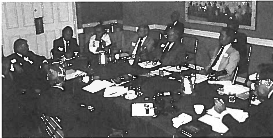
To discover why thermal storage has made such a hit in the greater Dallas metropolitan area, ES editors recently asked this panel of experts to meet and discuss the phenomenon. Included in the discussion were: an engineer, an educator, contractors, and representatives of building owners.

As far as any special problems, like the bearing burnout I mentioned earlier: We, as an electric utility, want to encourage thermal storage systems. We feel so confident in their ability to perform for us and the customer that we pay incentives. If the customer notifies us immediately of a problem and we see he's making a legitimate effort to correct the problem, and it's not a continuing problem, we will attempt to waive the demand on the building