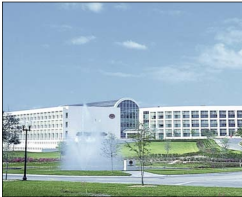
American Automobile Association Building — Lake Mary, Florida

The IceBank® system delivers a technology that companies around the world are proud to embrace as it affirms their commitment to conserve energy at both the generation and end-use level. From Plano, Texas to Pusan, Korea, business, industry and government are looking to CALMAC for energy efficient answers as they create ever-larger structures for the new millennium and beyond. The bigger they build, the better we look. CALMAC — the giant cooler in IceBank® storage systems.