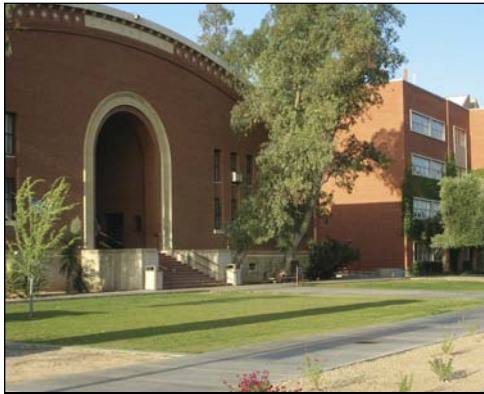
University of Arizona — Tucson, Arizona

Our IceBank® tanks are factory-made, modular units that are easily shipped and installed. They contain no moving parts, are constructed of non-corrosive materials and are backed by our 10 year limited warranty. And, we're extremely flexible when it comes to siting options. Employ them where they best fit in with your facility's design...indoors or out, stacked up, lined up, on the roof or even below ground.