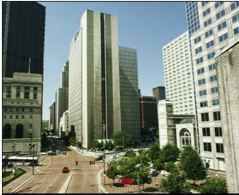
Moorehead Federal Building — Pittsburgh, Pennsylvania