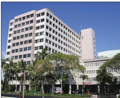
Kapiolani Medical Center — Pali Momi, Pearlridge, Hawaii