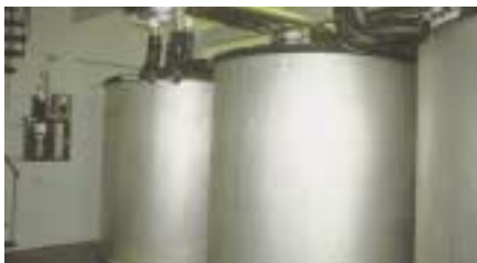
Skyline Elementary School, Cape Coral, FL