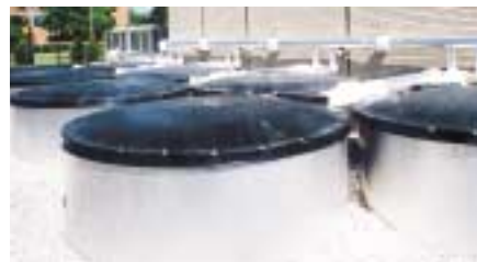
Fairfield Elementary School, Fort Wayne, IN