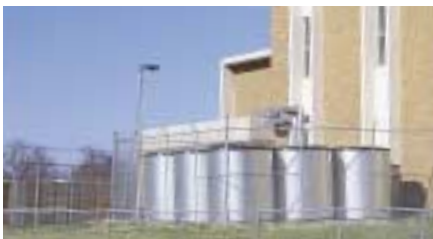
John F. Kennedy High School, Richmond, VA